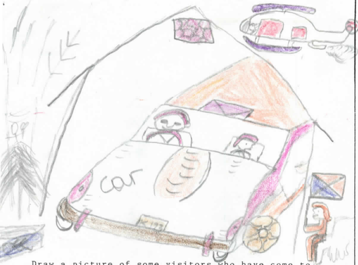
Draw a picture of some visitors who have come to Jamaica from far away.

If you would like to explain your drawing, use this space.